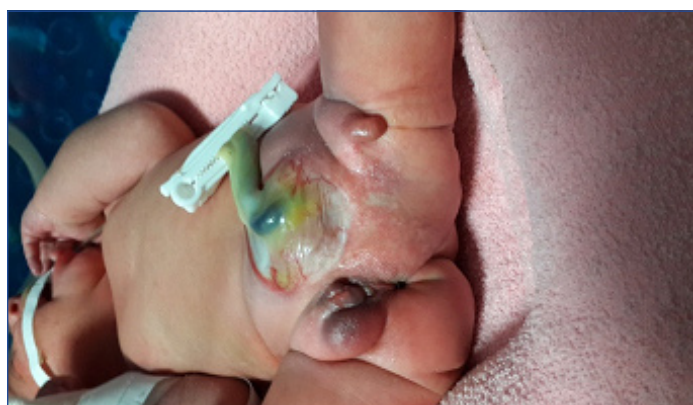
[Table/Fig-1]: Preoperative view, showing low-set umbilicus, lower wall abdominal defect and labia majora were separated with widened perineum.

Variants of the bladder exstrophy complex are rare. Pseudo-exstrophy is an exstrophy variant which has all the characteristics of the classical exstrophy without urinary tract defects [1]. The incidence of classic exstrophy is approximately 1 in 40,000 births. Exstrophy variants are less common [2], and pseudo-exstrophy