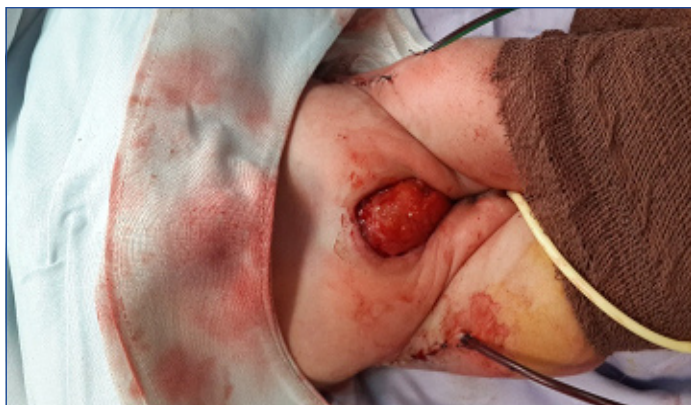
[Table/Fig-4]: Postoperative view after osteotomy and pubic closure.

of bladder has been described as an uncommon condition [3]. Hejtmancik et al., described the term “pseudo-exstrophy” in 1954. They reported a case of severe bladder prolapse between divergent abdominal muscles with intact bladder and no evidence of exstrophy [4]. Clinically, pseudo-exstrophy is the most benign form of the exstrophy [5]. This condition is associated with musculoskeletal defect, anteposed anus but the urethra is intact [6].